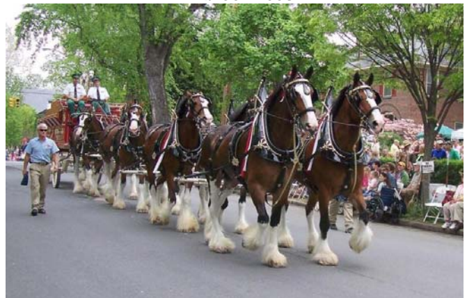
The Budweiser Clydesdales